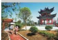
Park on the Campus