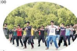
Wudang Kungfu Course