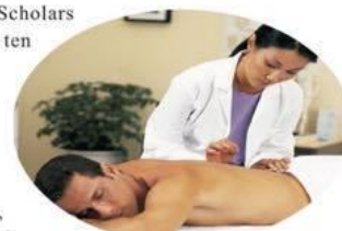
Traditional Chinese Medicine Course